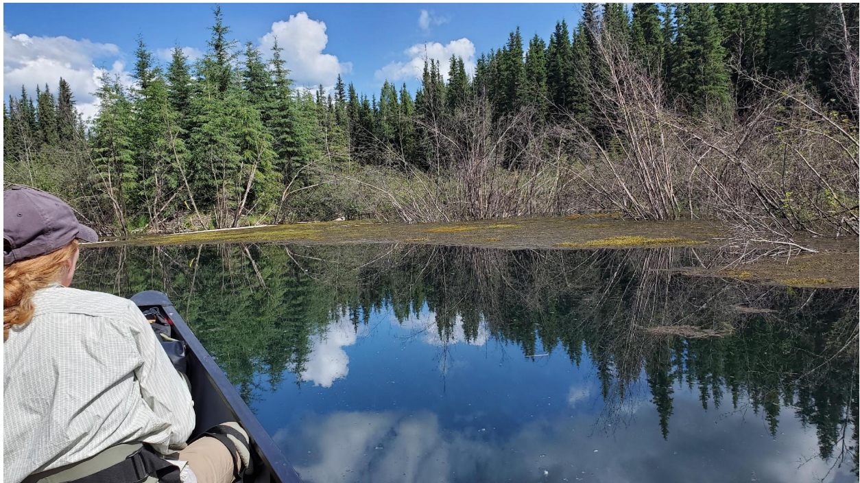
Site 1 seen from upstream during June 2021 sampling, note build-up of algae.