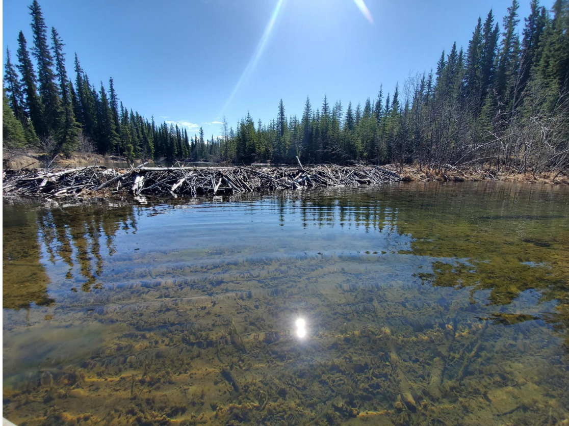
Site 1 from downstream looking upstream during May 2021 sampling, note algae.