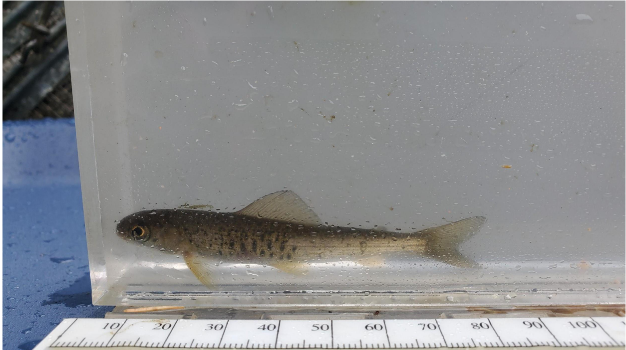
First Coho Salmon caught on Piledriver Slough in August, 2021!