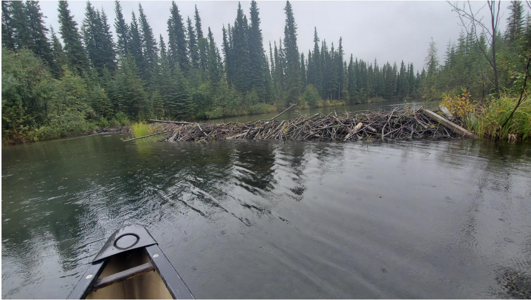
Site 1 from downstream looking upstream during August sampling with higher water.