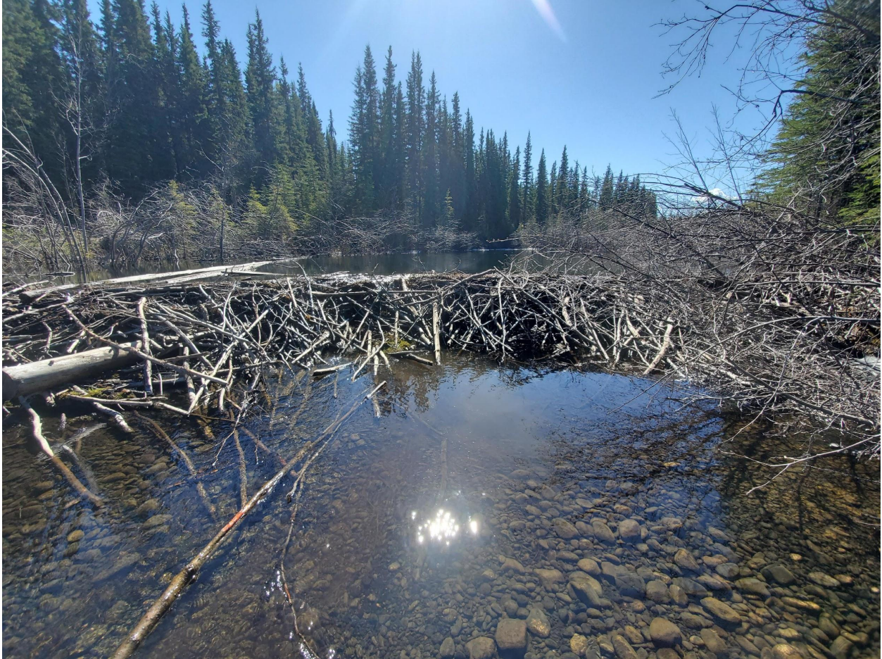
Site 4 dam from below during May sampling, note the low water.