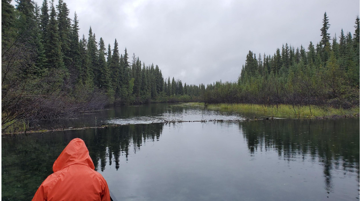
Dam 3 site during August sampling.