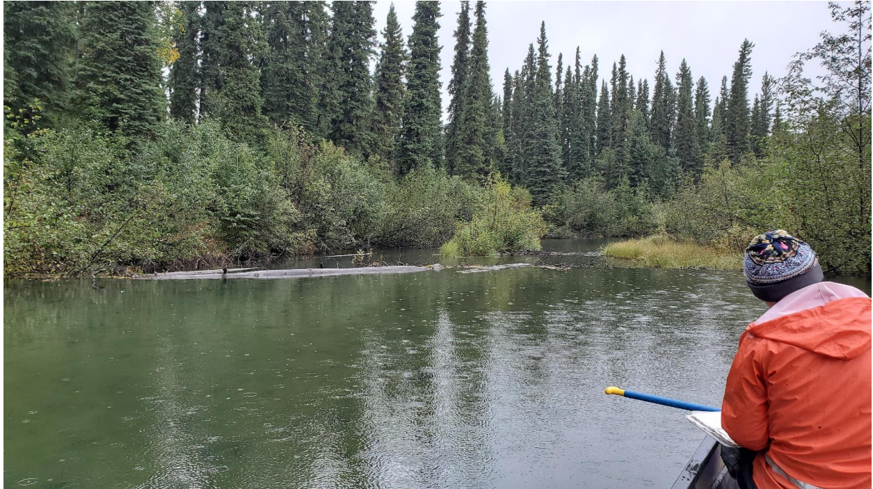
2019 Dam 1 looking downstream during August sampling, passage was not being blocked during the high water.

This was a secondary dam located just downstream of Site 2. 2019 was the first year that we have observed a dam at this location and it continued to be inhabited in 2020. It indicates the spread of the beaver colony in this area. In 2021 this dam did not appear to be actively maintained.