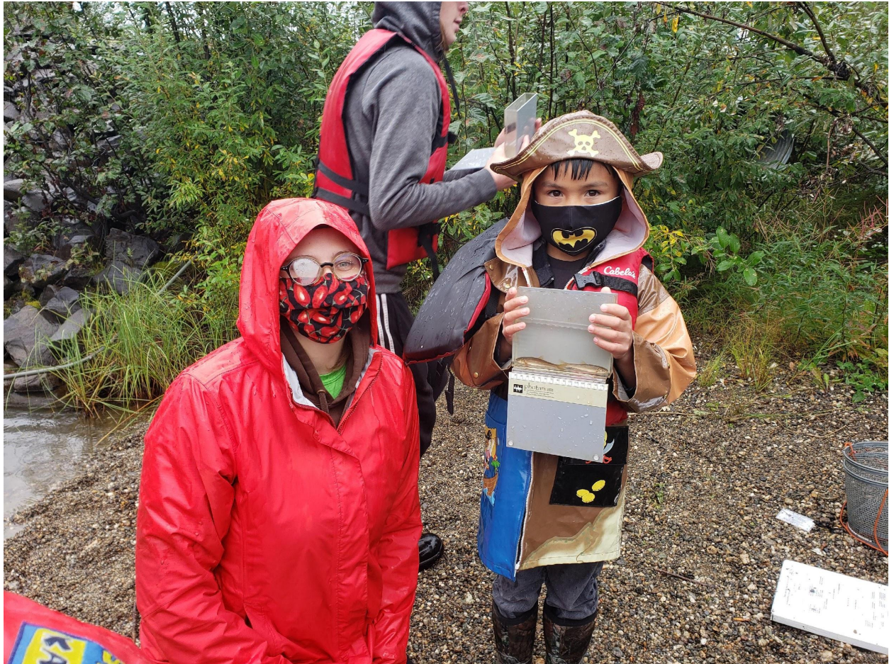
Salcha Elementary student and teacher with 2 lake chub at Upper Piledriver Site 1 during August sampling.

In 2021 TVWA field staff did not observe any adult or juvenile salmon on upper or lower Piledriver Slough. 2021 was a notably bad year for Summer and Fall Chum Salmon in the Tanana River drainage, the run was late and far smaller than usual, and fishing was closed on these species. For the second year in a row, we observed fewer than usual of the schools of Arctic Grayling on Lower Piledriver Slough and attribute this lack to the prevalence of large beaver dams.