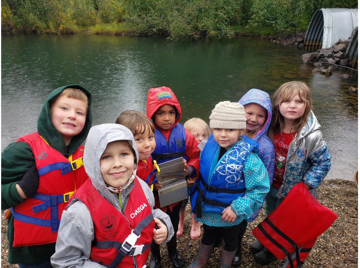
Salcha students with lake chub at site 4 during August 2021 sampling.

Fish Sampling: TVWA's "Chena Salmon" sampling protocol was used for recording information on fish. Gee-type minnow traps (23 x 45 cm, 0.64 cm wire mesh, with 2.5 cm diameter openings) were baited with salmon roe and set 5-10 mm apart for a 24-hour soak time (Swales, 1987). After the 24 hour soak, scientists identify and count all fish in the trap and determine length using a Photarium viewing box (Duvall, WA, USA). Fish were released after identification and measurements were taken. Any incidental fish deaths were labeled and brought to the USFWS laboratory in Fairbanks for further processing.