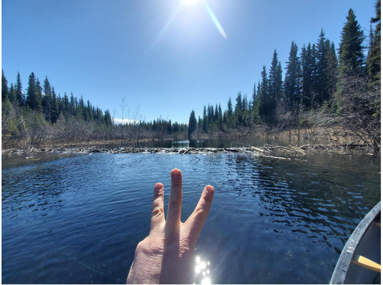
Dam 3 during May sampling.