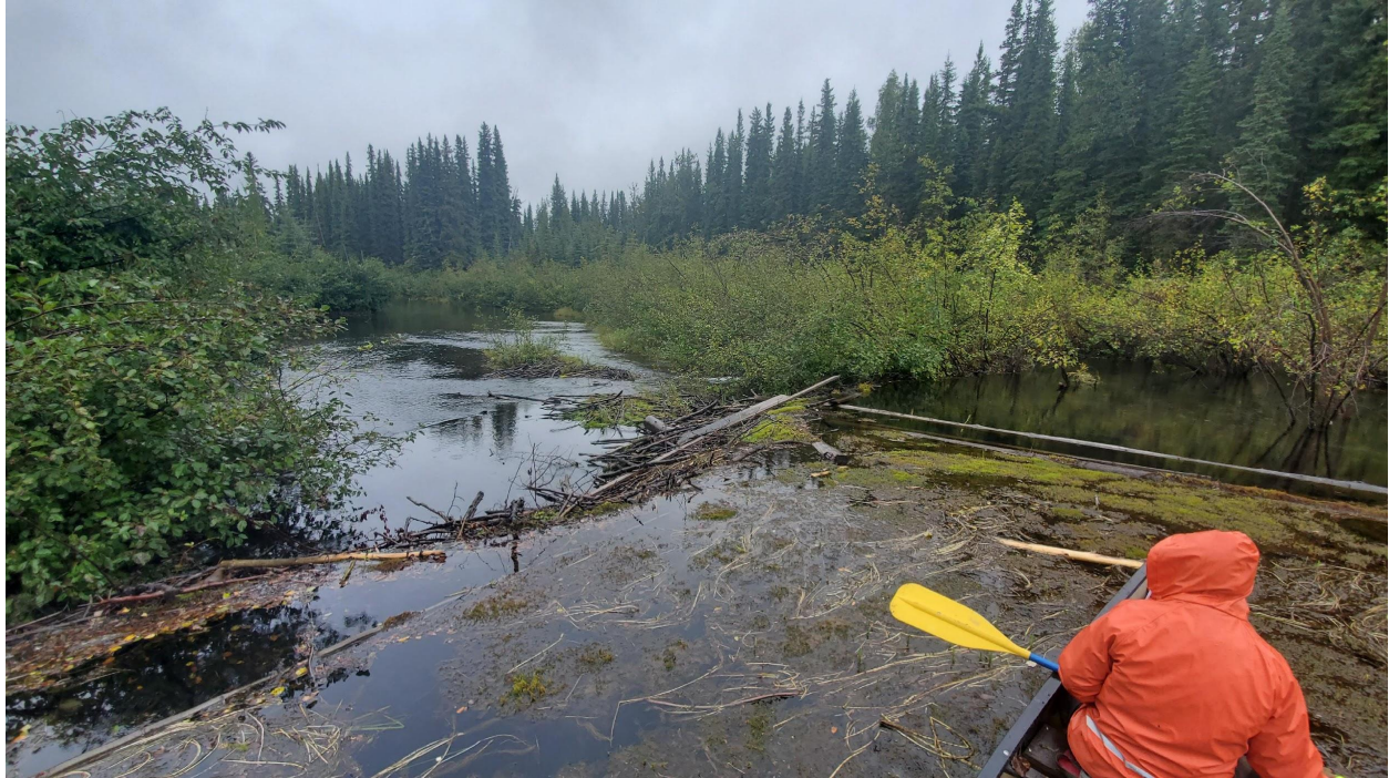
Site 4 Dam during August sampling seen from the top