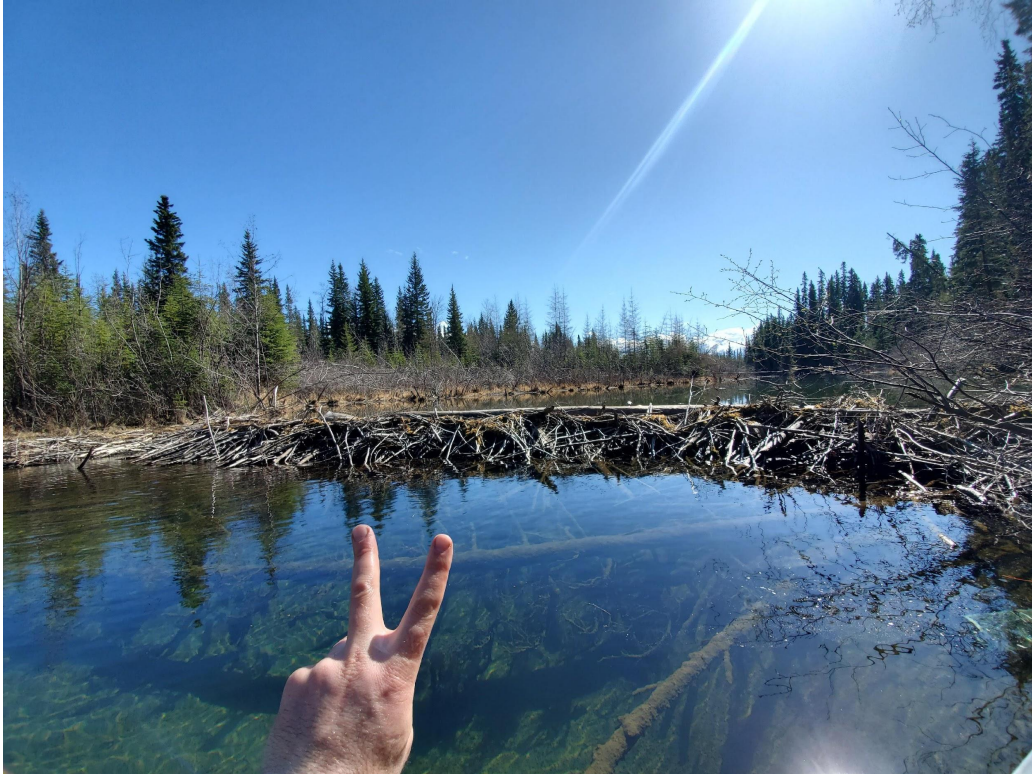
Site 2 seen from below during May sampling.