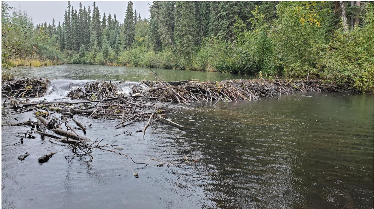
Site 2 seen from below during August sampling, note natural breach.