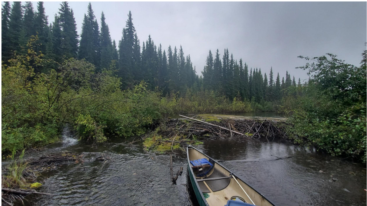
Site 4 dam during August sampling seen from below.